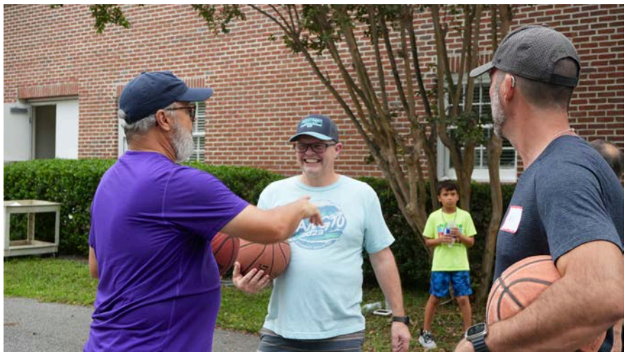
The Men's Ministry Burger Bash on August 24th was a hit with food, fun and games! Lots of fun for all ages!