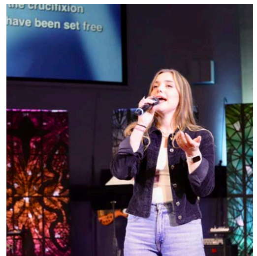
Thanks to all who joined for a special night of worship on August 11th to pray for our nation, city, church, schools and students.